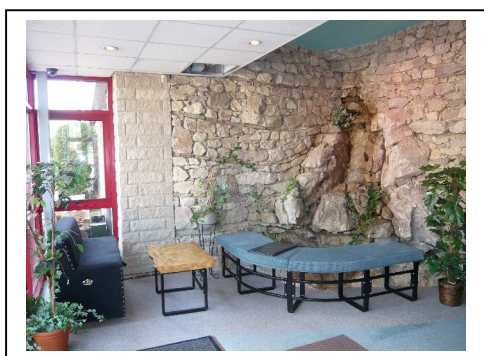
Ground floor reception

The ground floor works enjoy good delivery access on two sides with potential for offices to be created therein if required.